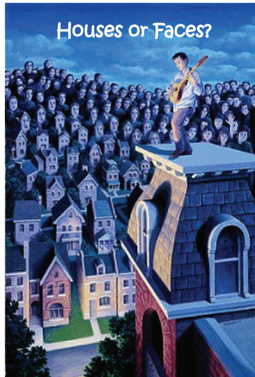
Houses or Faces?

The Power of Choice What our Campaign looks at Is what you believe The difference between What's real And what you perceive