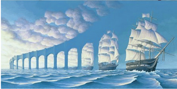
11 Ships or 3 Ships + Arches?