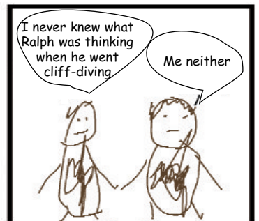
Don't you just hate it when a few people's choices give the whole group a reputation?