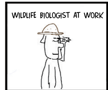
But wildlife biologists have discovered this is a myth.